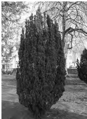
Child killer in action

A year ago Bristol-council planted 100 yew 1) trees on the Blaise Castle estate in the city. This week they cut them all down. A 'risk assessment' had decided that there was a danger that children might eat them. I found this odd. I have several yew trees in my garden, and two young children, and I now realise it is miraculous that the