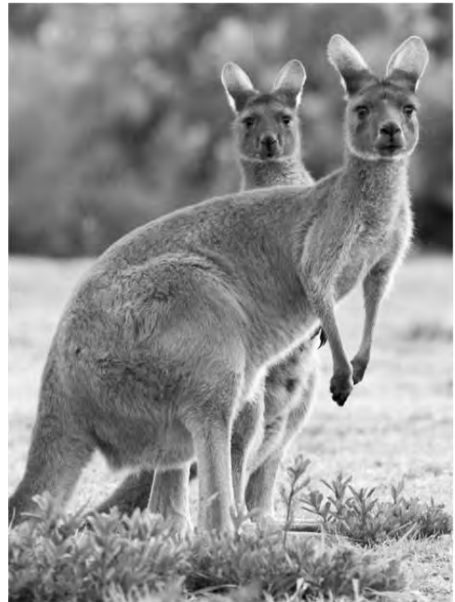
Two 'roos on the outlook